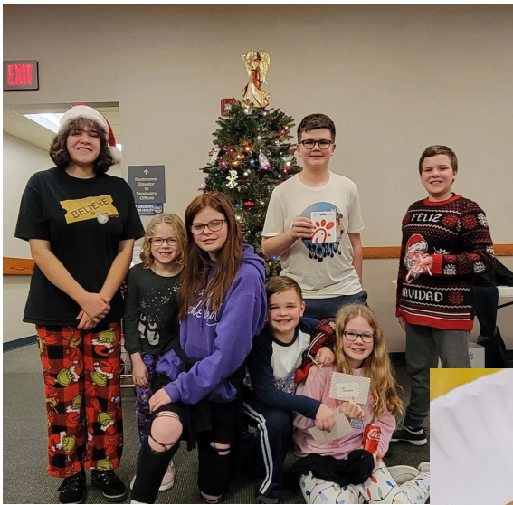
Some photos of the fun December happenings