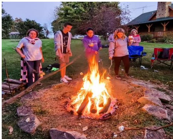
The Highpoint Youth Group recently enjoyed a fall evening of fishing and a bonfire at the Wadsworth Farm.

Our much loved Giving Tree will be setup again in front of Central for this holiday season! If you recall, Cheryl spearheaded this effort in 2020 to celebrate the spirit of giving in our church and we transformed our Easter cross into a tree of Giving displayed outside of our front doors on 7th street. Central members and others in the community donated hats, gloves, socks, hygiene items and more that could be easily taken by anyone who was in need. Gently used sweaters and coats are also needed. Plans are to have the tree setup by Sunday, December 5 with donations being accepted leading up to and during worship that day. Ellie (and willing volunteers!) will help to keep the tree stocked through the month of December. Be on the lookout for more info in the enews and bulletin with info about tree setup and donation collections. We are confident that our church family will once again come together to support this meaningful and much needed opportunity for giving during the holiday season.